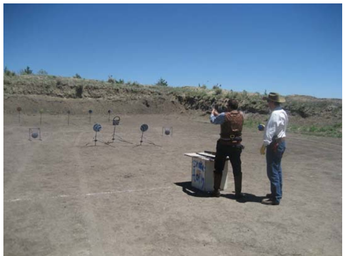
Widow Maker Returns