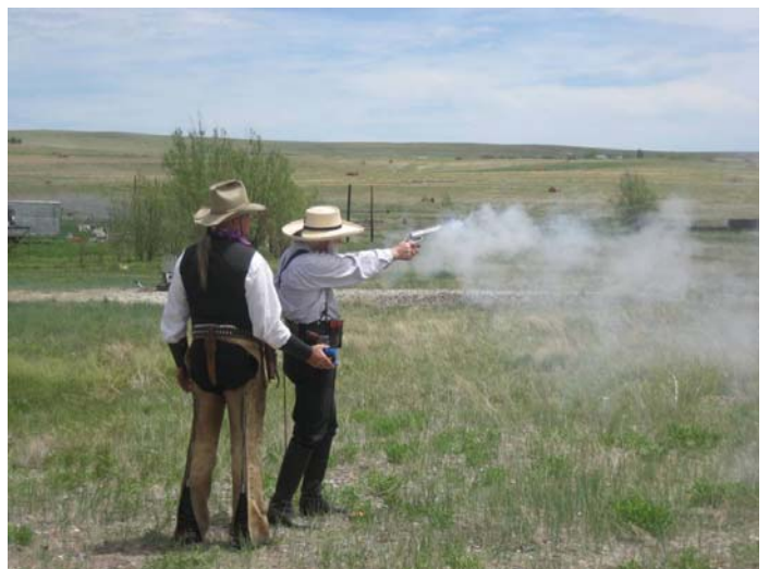
Silverton Demonstrates Frontier Cartridge