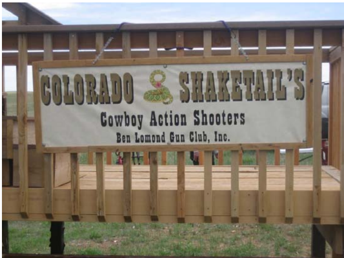
Our Banner Promoting the Shaketails and BLGC